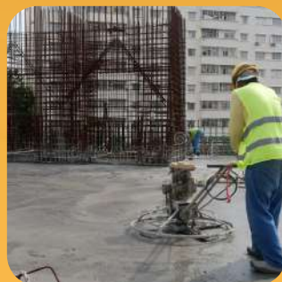
Scaffolding Power float