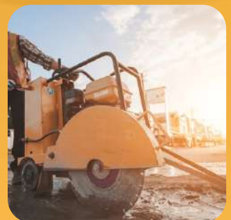
Concrete Cutting Machine