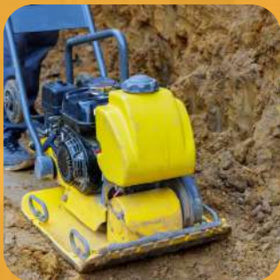
Hoist Compacting plate