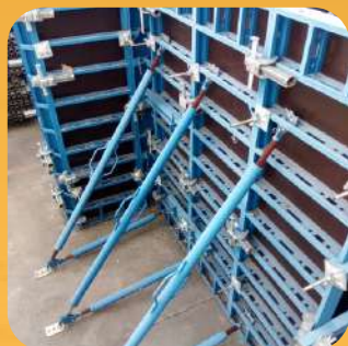
Steel Foam Work