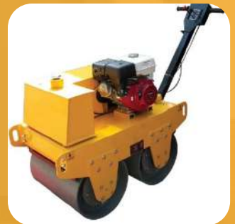
Vibrating Roller Compressor