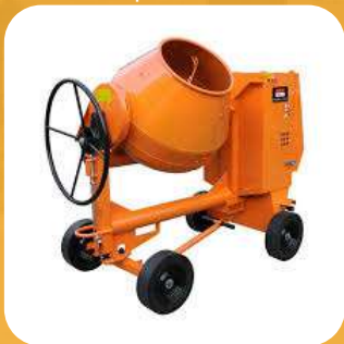
Breaker Concrete Mixer